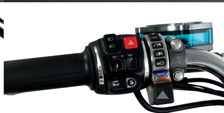
Bluetooth with Sound System