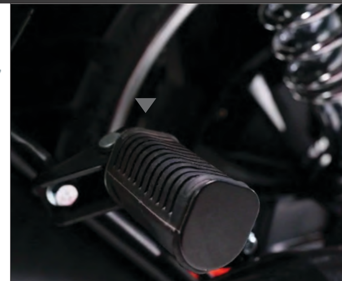
Dual Passenger Footrest