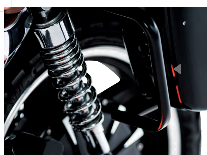
Rear Protection Guard