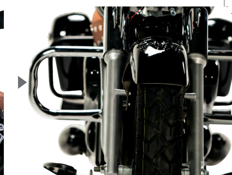
Front Body Guard