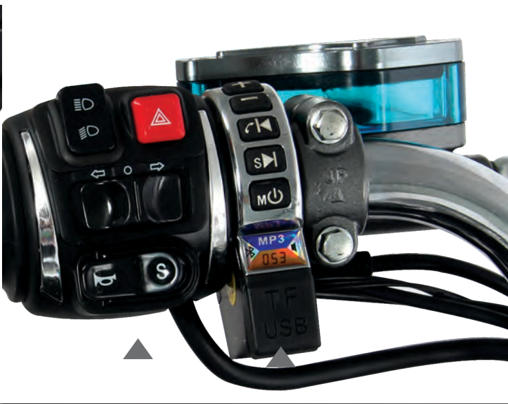
MobileCharging Unit/ Turbo Mode