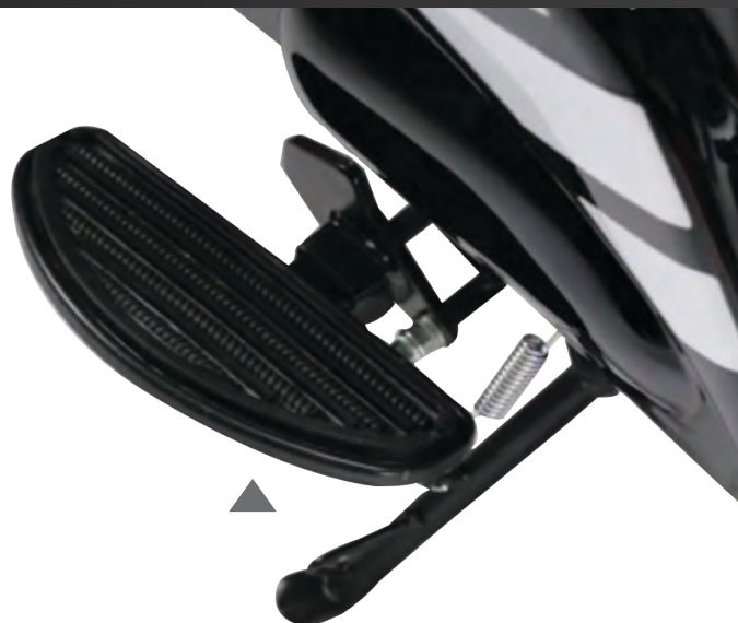
Dual Passenger Footrest