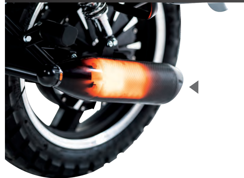
Dual Sound pipes with flame effect