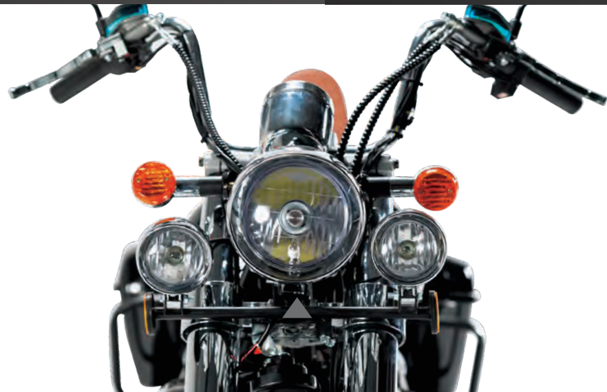
LED + Additional Headlamp