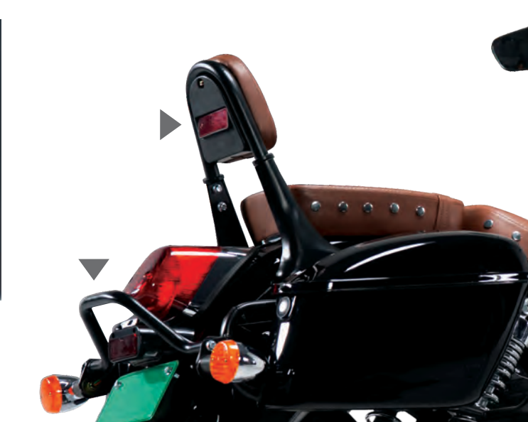
Rear Tail Lamp Guard & Rear Back Rest