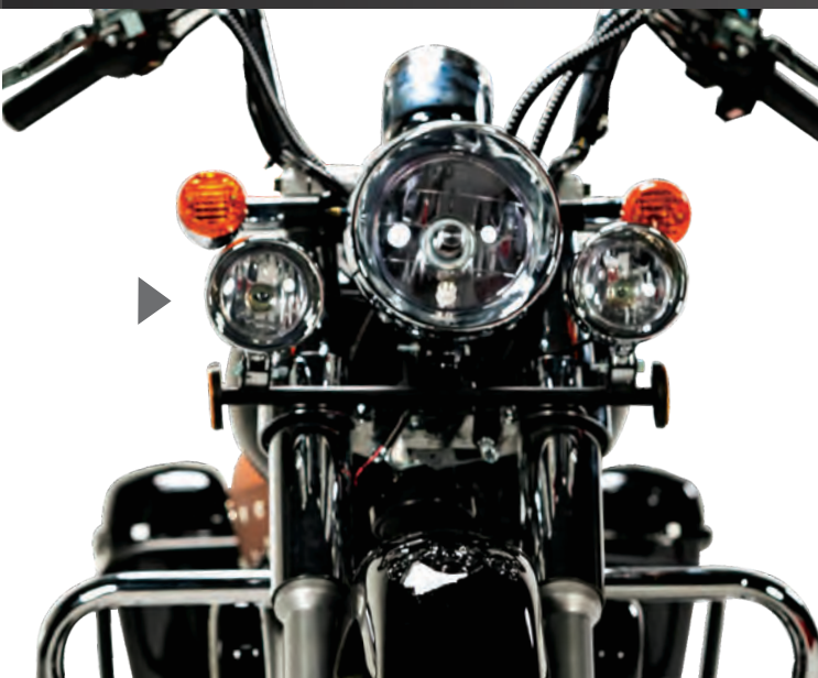
Triple Head Lamp