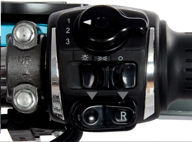
Reverse / Cruise Control