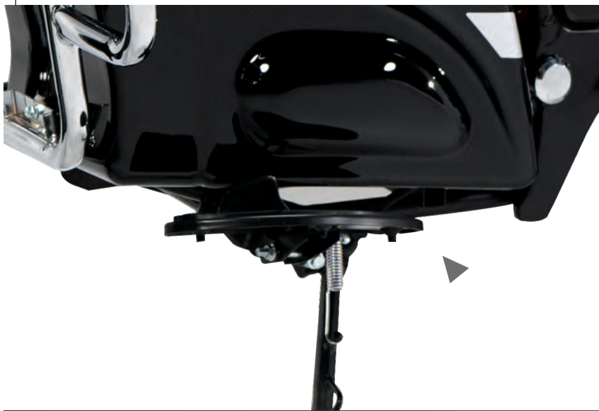
Side Stand Sensor